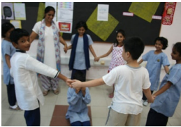
Our youngsters busy at work and having fun too.

इसी प्रकार होली का महापर्व विश्व के कोने-कोने में अपनी अनोखी छटा बिखेरता नज़र आता है । है न अनुपम यह त्योहार !