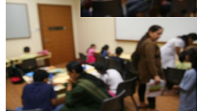
ENJOYING HINDI STORY TELLING SESSIONS

Hindi Reading Programme in our office premises at Mahatma Gandhi Memorial.