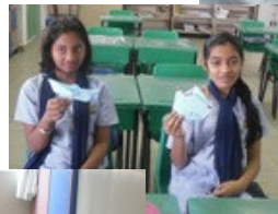
Competitions in progress at the schools and Centres

Our theme this year is 'Go Green, Save Earth'. Holi celebrations have been themed around this message and our students and teachers have all participated in the art competitions by creating things of beauty out of recycled materials.